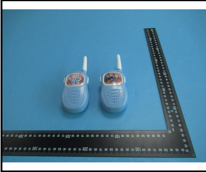
Photograph of Sample